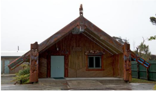
Te Tauraka Waka a Māui marae