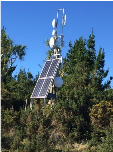
WiFi Connect - Hokitika