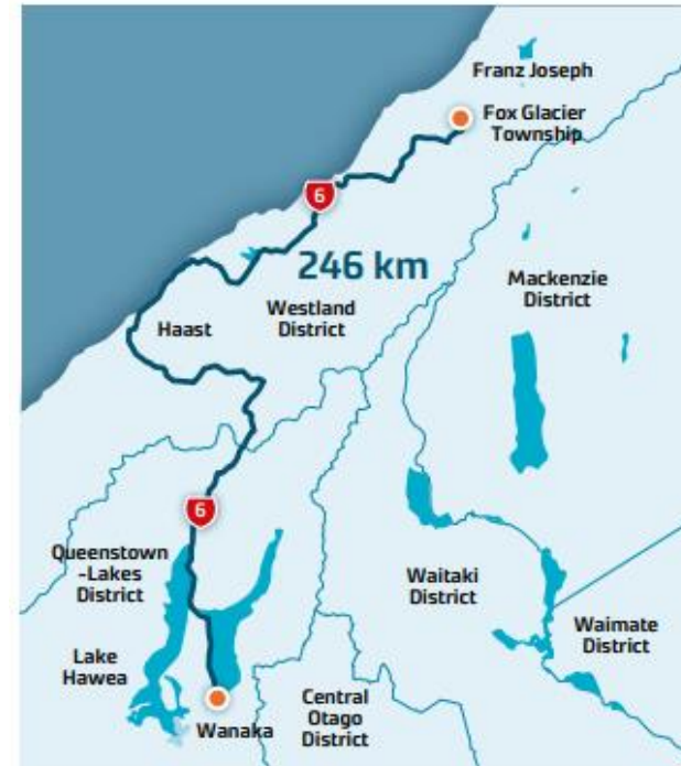
FOX GLACIER - HAAST - LAKE HAWEA FIBRE LINK