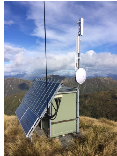
WiFi Connect - Mt French