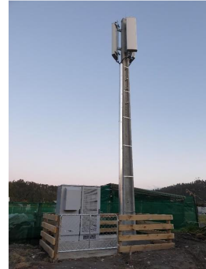
RCG - Okarito Lagoon