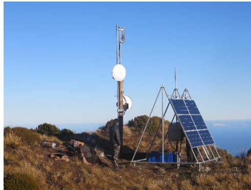
WiFi Connect - Karangarua