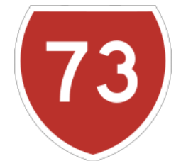
Islands of coverage on SH6 and SH73