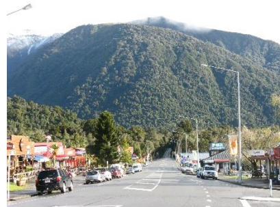
Fox Glacier Townshipp